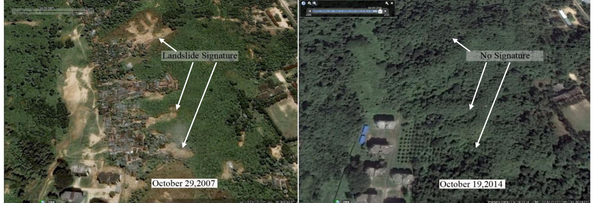
Figure2: Image shows the signature of October 29,2007 landslide (left) and the current situation during field visit in October 19,2014 (right); Source: Google Earth

The visual image interpretations technique has been applied to draw the polygon around the displacement mass. The figure 2 shows Kaichaghona area near Chittagong cantonment where a devastating landslide in June 2007 took many lives from foothill slum. Documentation of such landslide events in these restricted area is much more challenging. The remote sensing imageries are useful to deal with these challenges.Landslide signature extraction from visual or digital interpretation of remote sensing time series imagery can help landslide mapping.