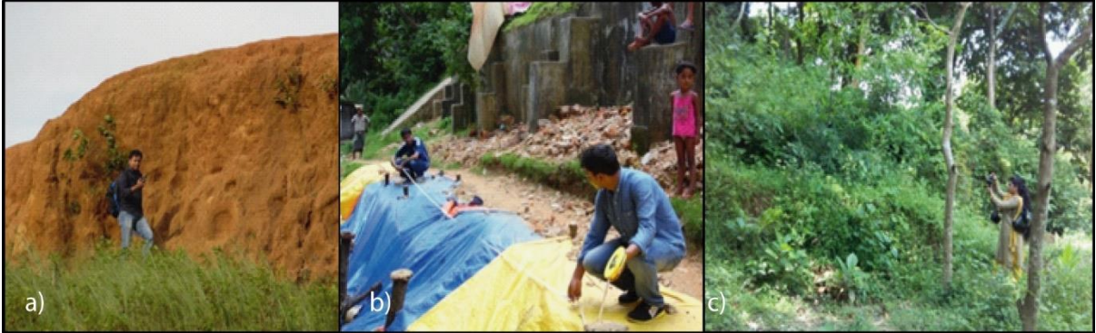
Figure 1: Field Survey (a) Taking GPS measurement (Latitude, longitude, and elevation) (b) Measuring displacement of mass, (c) Taking Photographs