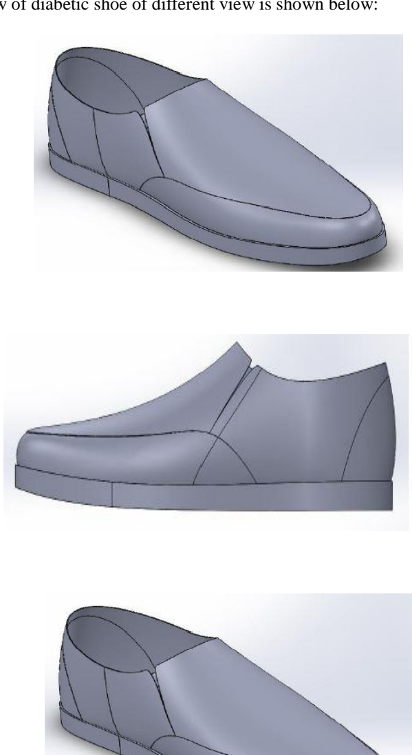
Fig.2: Sketch view of diabetic shoe by solidworks.

configures footwear from patient data gathering, to shoes design, until manufacturing and usage. The environment of CAD will be discussed on its prime functionalities. Insoles and outsoles modules are under development together with the material selector system since they are confirm interrelated. Insole and outsole shapes will be based on design criteria deriving from the combination of measured foot pressure and material behavior. Also other parts of the diabetic shoe are designed by Biomechanical CAD [4]. The main criteria of insole and ousole and upper are so much different from each other's. The upper materials of this shoe is so soft and flexible. The outsole and insole are soft and flexible. The toe portions of this shoe are wide, soft and flexible so that there is no rubbing between toe portion and foot and not resulting the foot ulceration. The geometric view of diabetic shoe of different view is shown below: