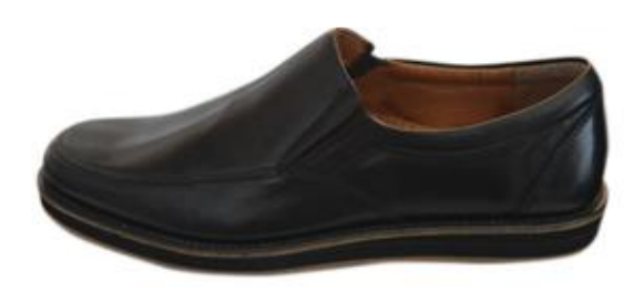
Fig.3: complete diabetic shoes.