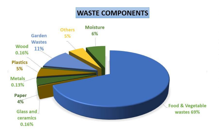
Fig.1: Composition of Municipal Wastes in Bangladesh Source: Carncross and Feachem, 1993, *IFRID and BCSIR, 1998, **Field survey

As is seen from the pie chart, there is very high percentage of food, vegetable and garden waste in Bangladesh. All of which is bio-degradable and hence municipal waste in Bangladesh will be a potential source for Bio gas production.