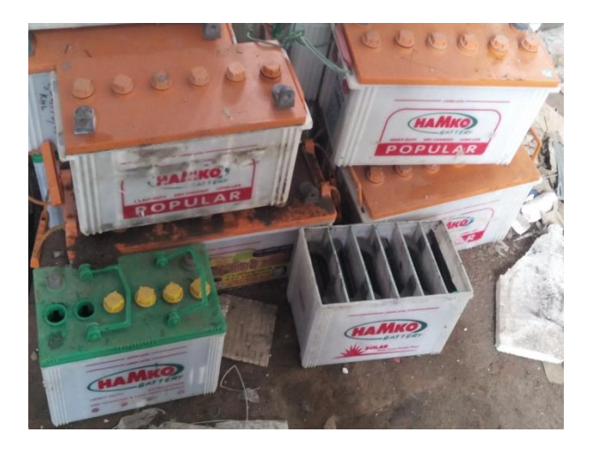
Fig.3: Wasted batteries due to lack of maintenance