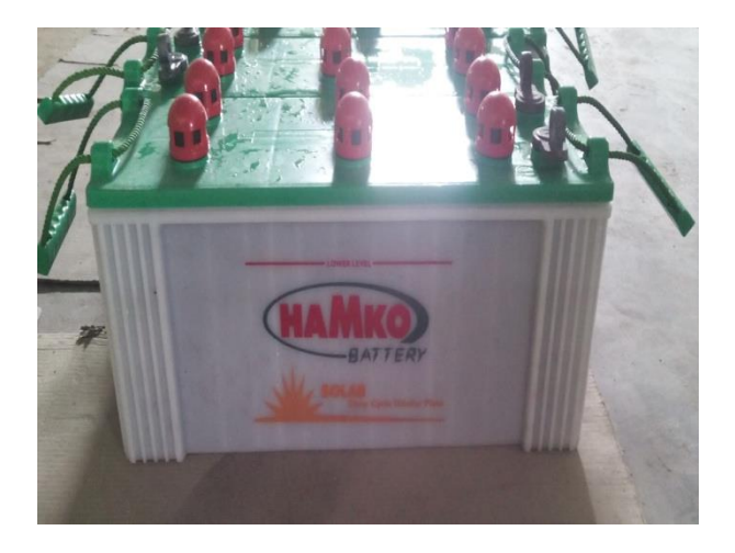
Fig.2: Battery regularly maintained

accelerated, increasing problems with the forklift electronics and to some extent, affecting the longevity of the battery. Furthermore, many battery problems are caused by loose or corroded connections which are the results of lack of proper care of battery. But the proper maintaining of the battery always ensures proper charging, proper watering and proper care of the battery. It keeps the battery free from all problems and ensures long life of the battery. It also keeps the consistency in battery performance. So, the importance of proper battery maintenance is beyond any question.