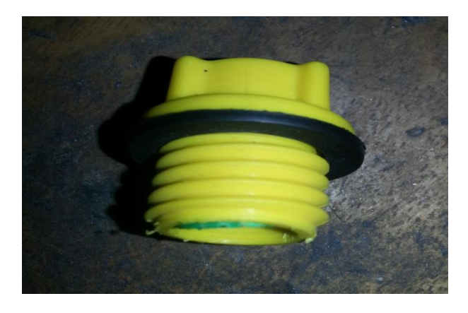
Fig.4: Vent cap of battery

Proper ventilation is required for batteries because of gasification. Generated gas during electrolysis in battery should have enough space for escaping. If it is not done, there may be occurred explosion by generated gas. For this purpose, vent cap can be used in battery. It increases safety in poorly-ventilated area. It is advantageous over all other ventilation system. It only provides escape path for harmful and unnecessary gases and helps to prevent steam from escaping. It condenses the steam into water which in turn helps to reduce watering intervals. But vent caps should always be kept tight and gas vent should always be kept opened. Any missing or worn vent plug gaskets should be replaced. The room in which batteries are kept should also have proper ventilation system so that gases have enough space for escaping from the room.