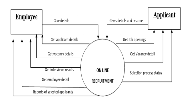
Fig 2: Data flow diagram of employee and applicant level with the system