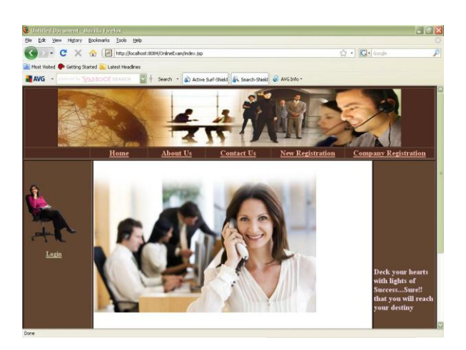
Fig 4: A preview of online recruitment system